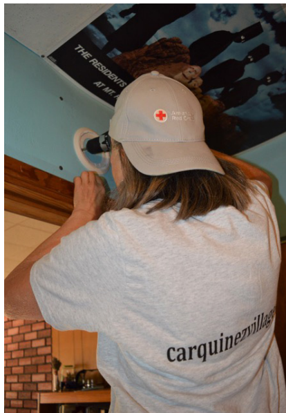
CV Volunteer installing a smoke detector in 2019

In coordination with the Solano County chapter of the American Red Cross, the Carquinez Village is offering a free “Sound the Alarm” smoke detector installation event for all members and all volunteers. The goal is to ensure that all homes are made safer with the proper installation and placement of 10-year Kidde smoke detectors. Volunteers from both organizations will team up to provide the installation and a brief fire safety education component and will install as many alarms as needed, based on the size and arrangement of each living space.